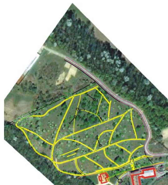
Figure 1: Amendment of the drawing