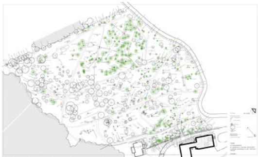
Figure 2: Dendrological drawing of the object

In comparison with traditional inventory methods the remote sensing data tend to produce better results representing vegetation cover. In the case of vegetation mapping using very high resolution satellite data, the results are useful in combination with traditional methods results, because the image provides additional information about the location and size of trees in the image objects delineated by the sketch. Anyhow some gaps in the drawing come into sight during the drawing amendment. To rectify these gaps, additional field work is needed, with an electronic telemeter.