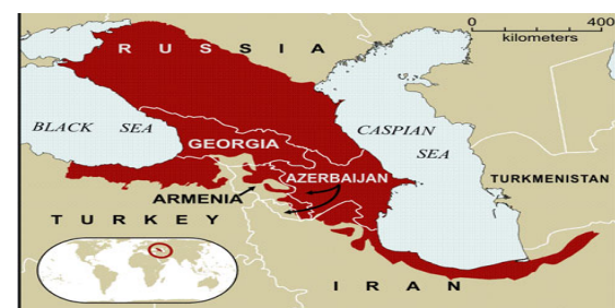
Figure 2: Map hotspots in Irano-Anatolian&Caucasus

Turkey contains a great variety of natural habitats, ranging from Mediterranean, Aegean, and Black Sea