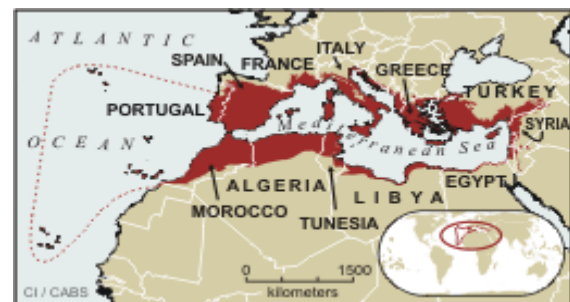
Figure 1: Map of hotspots in Mediterranean Basin

Turkey has a special location in the Global Biodiversity Hotspots Map of CI. Because the territory of Turkey is located in three of these 34 major areas that are Mediterranean Basin, Irano-Anatolian and the part of Caucasus vegetation (Conservation International, 2012; Medail and Quézel, 1998). It is a scientific truth that Turkey has one of the richest natural heritage in temperate zone with approximately 11.000 plant taxa-one thirds of them are endemic, 160 mammal, 450 bird, 120 reptile, more than 500 fish species and habitats provide living area for them (Conservation International, 2012; Guner et.al. 2000; Kalem 2008).