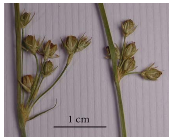
Figure 3: Juncus filiformis - inflorescences (herbarium specimens)

The authors are grateful to the reviewers M. Kostadinovski (Skopje) and M. Niketić (Beograd) for useful suggestions which improved the manuscript, and to M. Niketić also for sending us a scan of the cited herbarium specimens of Juncus sp.