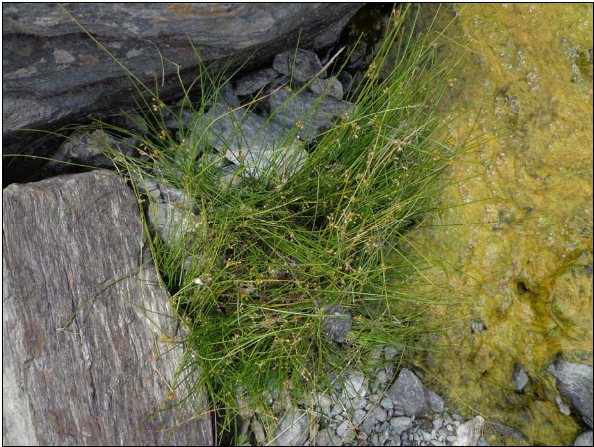
Figure 2: Juncus filiformis